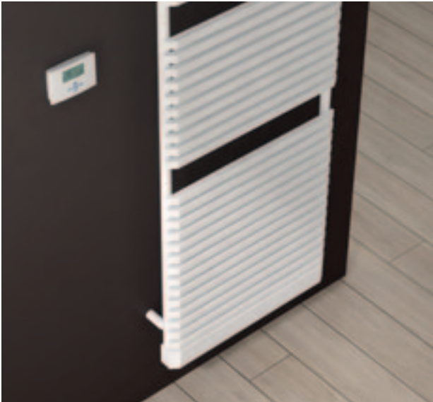
The soberly elegant design of the elements and the painstaking attention to detail can also be seen in the 4 invisible well attachments.