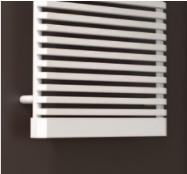
The exclusivity of this electric designer radiator comes from the innovative electronics incorporated completely into its design.