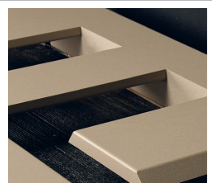
Detail of the radiator Dedalo painted in Quartz 2 (cod. 2C).

DEDALO is characterised by its precision-machined steel giving it a defined, unconcealed personality. Continuous geometry to enhance your ambient with refined, sought-after detail.